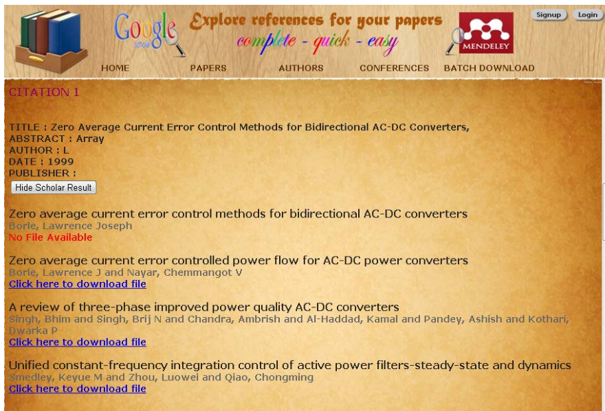
Fig. 3. Result of Related Paper Query