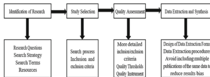
Figure 1. Systematic Literature Review and Mapping Diagram (Kitchenham, 2004)

This section discusses the methodology used to conduct SLR. The activities carried out refer to figure 1. Figure 1 begins with the identification of the need for SLR, followed by research question formulation, the searching process using keywords, screening of papers, keywording using abstract, and the data extraction mapping process.